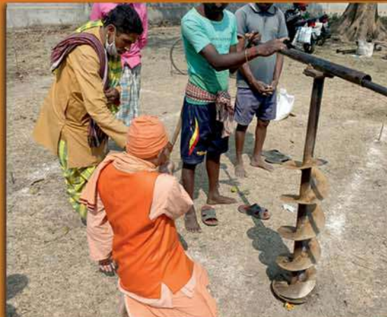
Bhumi Puja at Balasore branch, Odisha on 09.05.2021