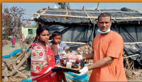
Yash Relief at Frejerganj on 28.05.2021