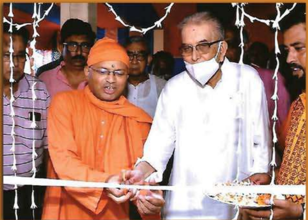
Vocational Training Centre Opening at Mosat, Hooghly by Hon'ble Justice Shyamal Kr. Sen