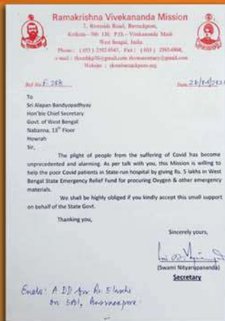
Covid Relief Letter on 26.04.2021