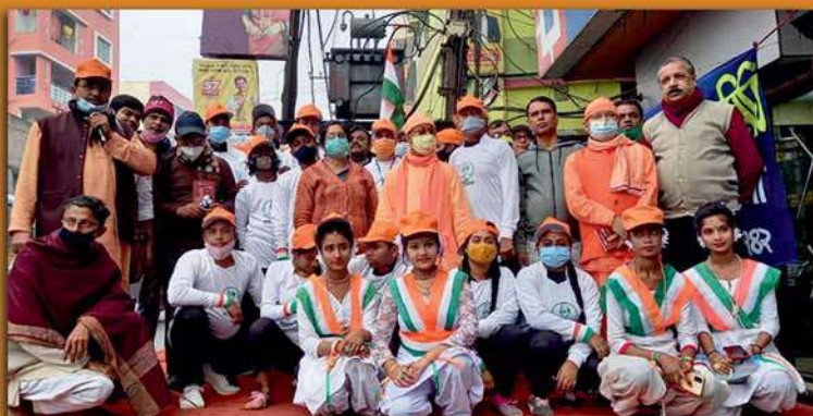
Celebration of 125th Birthday of Netaji Subhas Chandra Bose at Dankuni, Hooghly