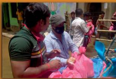
Flood Relief work at Khanakul, Hooghly on 09.08.2021