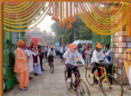
Celebration of 125th Birthday of Netaji Subhas Chandra Bose at Dankuni, and Cycle Rally