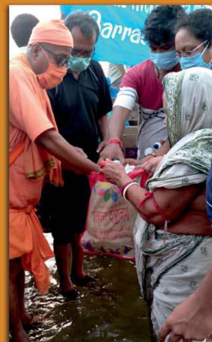
Flood Relief work at Udaynarayanpur, Howrah on 08.08.2021