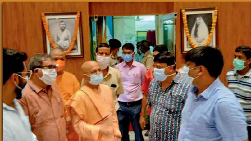
Visit of District Magistrate North 24 Parganas at Hedaquarter during Covid Vaccine Camp on 22.07.2021