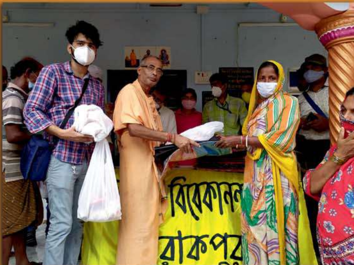
Yash Relief at Mandarmoni Branch on 30.05.2021