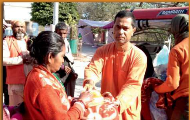
Winter Relief at Haridwar Branch on 01.01.2022