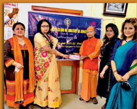
Inner Wheel Club donated money to the Mission on 19.11.2021