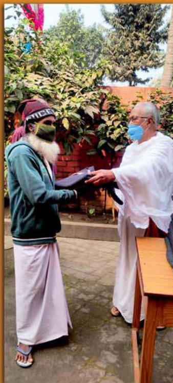
Winter Garments Relief at Suryapur on 26.12.2021