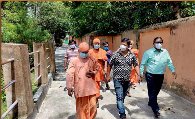
Visit of CMOH, North 24 Pgs at Suryapur Hospital on 17.07.2021