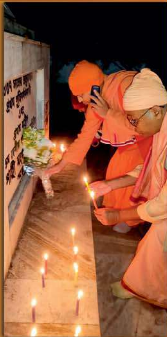
Candel Rally in memory of General Bipin Rawath at Barrackpore on 08.12.2021