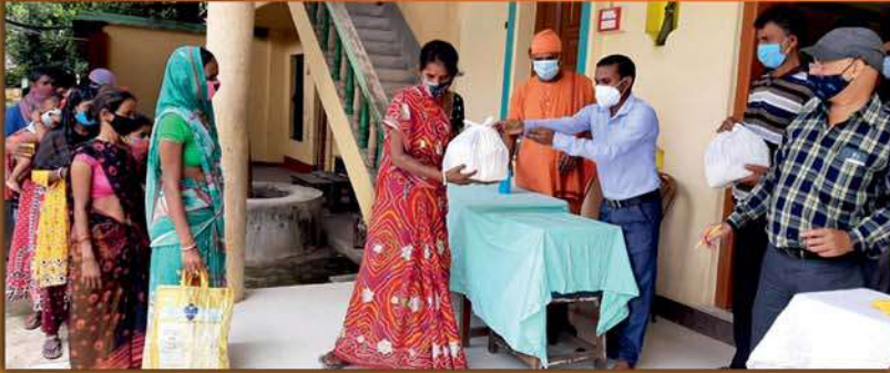
Covid Relief at Barrackpore on 12.06.2021