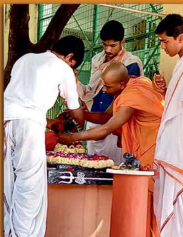
Nandi Pratistha at Barrackpore on 01.03.2022