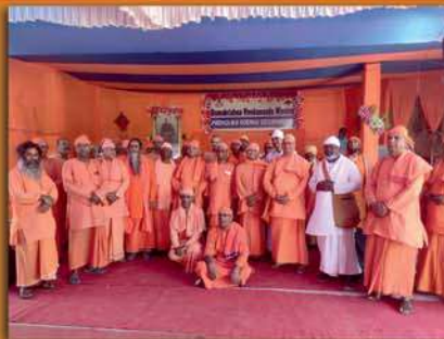
Sadhu Bhandara at Chanditala on 13.03.2022