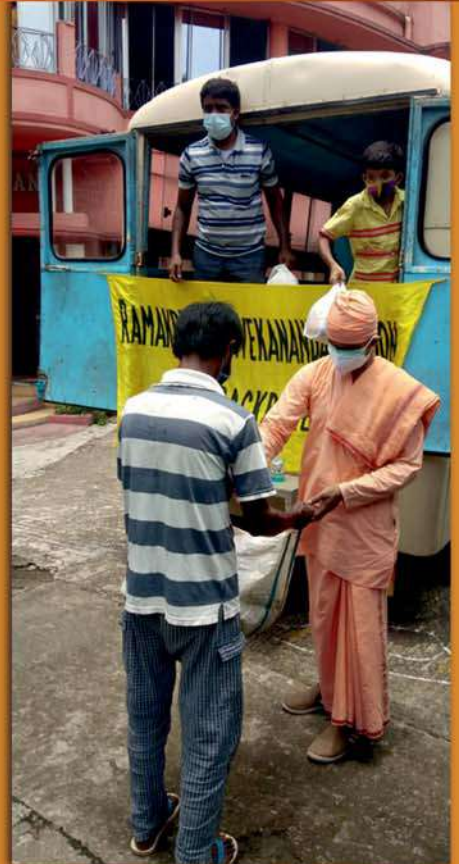
Covid Relief on 12.06.2021 at Suryapur