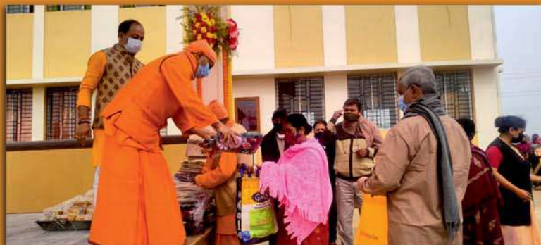
Relief work at Chanditala Branch on 12.01.2022