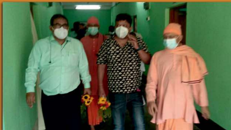
Visit of CMOH, North 24 Pgs at Suryapur Hospital on 17.07.2021