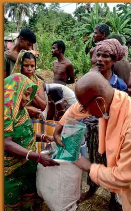
Flood Relief work at Purba Medinipur on 06.10.2021