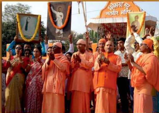
Sadhu Bhandara at Madhupur Branch Jharkhand on 02.08.2021