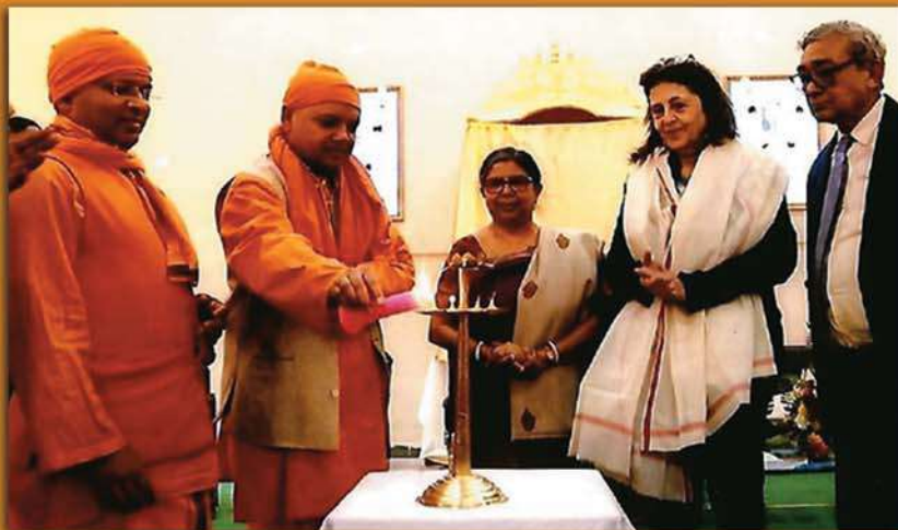
Swami Nityamnanda Training Hall Opening Ceremony at Joyrambati, Bankura