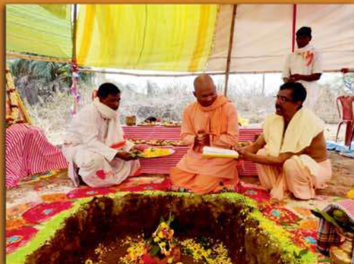
Bhumi Puja of Swami Nityananda Training Hall at Joyrambati