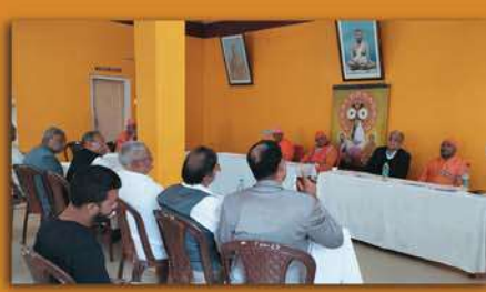
Governing Body Meeting at Barrackpore